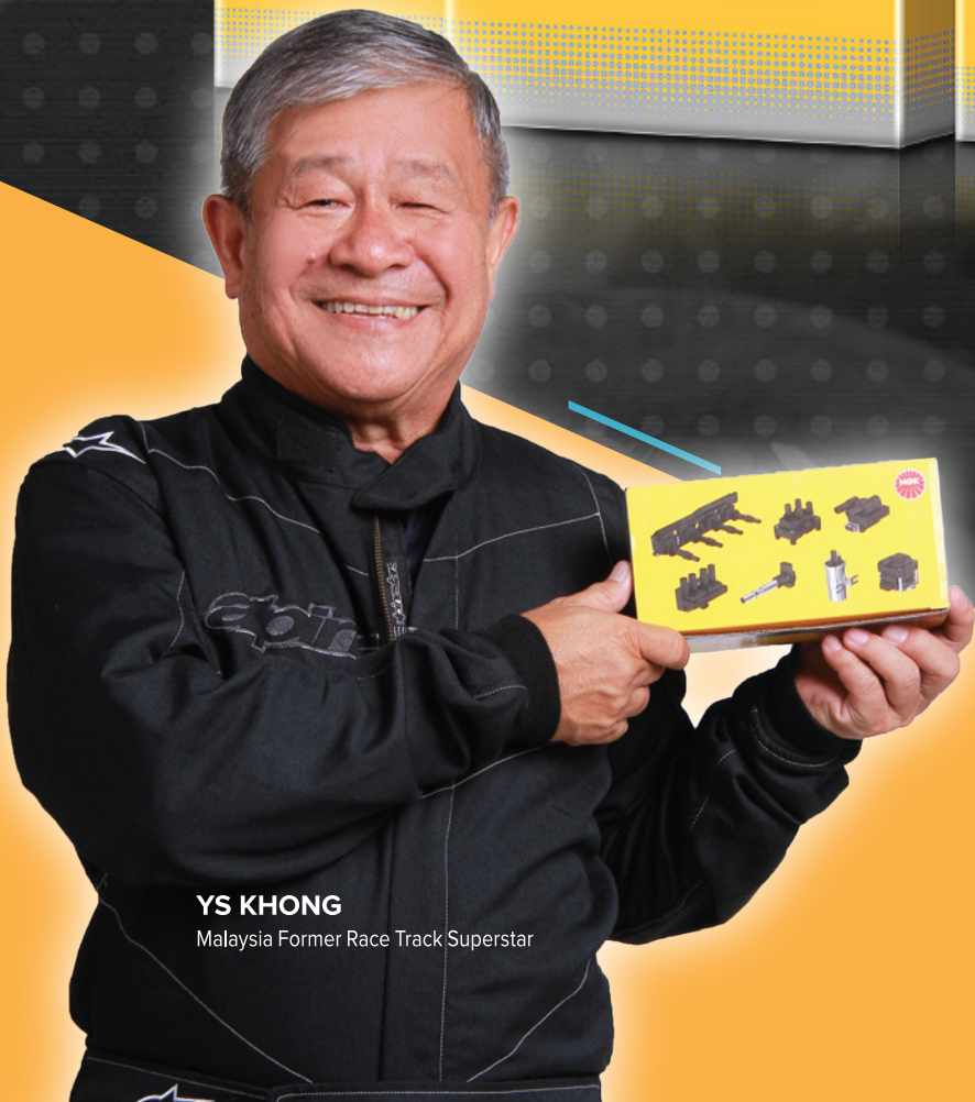
YS KHONG Malaysia Former Race Track Superstar